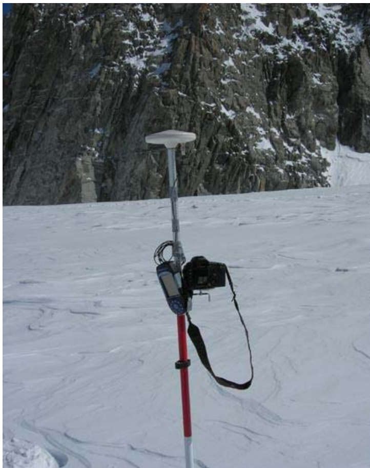
High resolution digital camera (Nikon D700) coupled to GPS for the photo-GPS technique used at Aiguilles Marbrées North face (Mont Blanc massif).